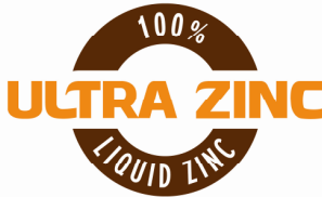
Available Zinc (ppm)

Town: Wee Waa State: New South Wales Crop: Sorghum Soil Type: Heavy black clay Irrigation Type: Flood Application Rate: 5 Lt / hectare Application Method: Boom Spray Sample Depth: 0-30 cm